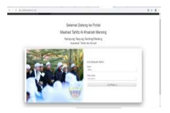
Figure 3. Registration of Teacher's Interface

ensure the smoothness of academic process in the school. Each teacher must have username and a unique password to ease their teaching and learning management. Refer Figure 3.