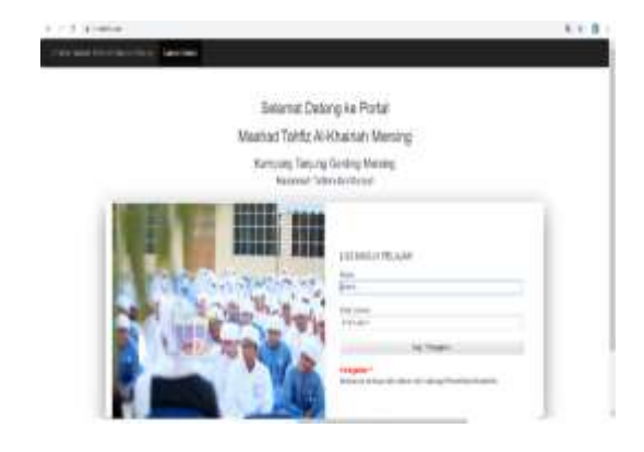
Figure 2. Registration of New Student's Interface.

In this portion, the findings of existence systems that provides actual results is implemented. For this purpose, it is appropriate to determine the range of capabilities of e-Tahfiz System. The essential of human computer interface in need to consider simplicity and coherent as well as straightforward to utilize. Furthermore, in this section, the developer has highlighted user-friendly web design element according to the requirement of web interfaces principle as illustrated in Figure 2 to Figure 4. The followings are the related interfaces of web involve student, teacher and academic fees for academic matters in MATAM and e-Tahfiz System.