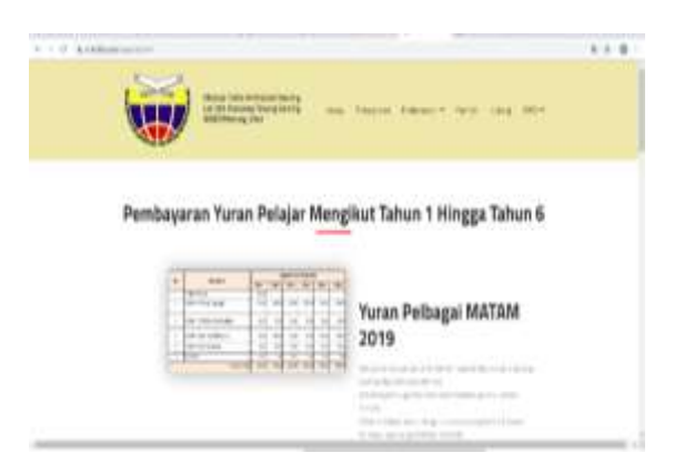
Figure 4. Registration of Fees Payment Interface

The module of e-Tahfiz System allows parents to monitor and check the information of registration, academic and payment record to ensure the accurate amount implemented and future use record. Each parents must have username and a unique password to ease their monitoring management. Refer Figure 4.